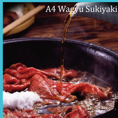
A4 Wagyu Suki-yaki