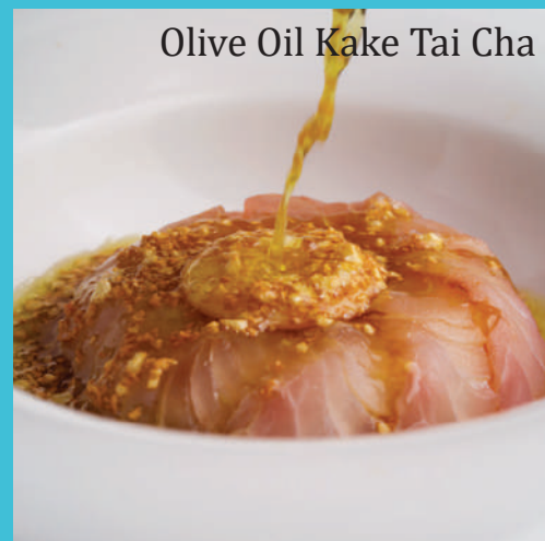
Olive Oil Kake Tai Cha